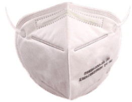
fitted N-95 respirator