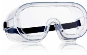
goggles without holes