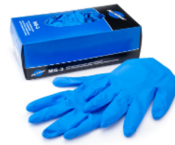
rubber, nitrile, or neoprene gloves